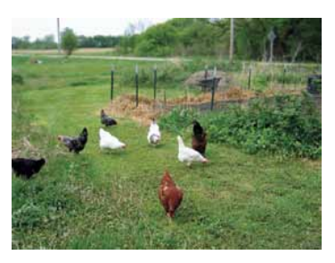
Chickens are usually housed in groups outdoors where they can forage. (Karin Kanton, DVM)